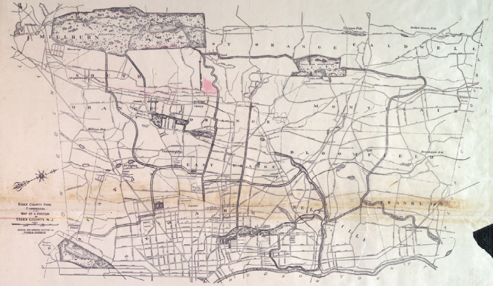
GENERAL MAP OF THE ENTIRE IMPROVEMENT.