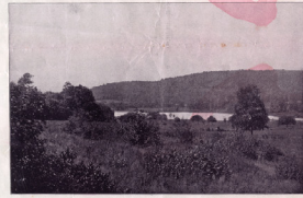
View from South Mountain Reservation.

...the Commission was the following: Salaries, $10,000.00; Travel, $5,000.00; Printing, $2,000.00; Stationery, $1,000.00; Telephone, $500.00; Postage, $500.00; Lighting, $500.00; Water, $500.00; Gas, $500.00; Electricity, $500.00; Heat, $500.00; Repairs, $500.00; Insurance, $500.00; Contingencies, $500.00; Total, $28,000.00.