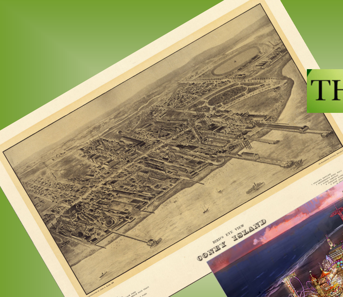
BIRD'S EYE VIEW CONEY ISLAND

1 LODGE PARK 2 BOARDWALK 3 RAILROAD STATION 4 CIRCUS 5 CANTONMENT