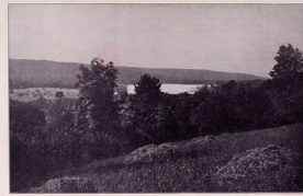
General View of Reservation from North East-South Mountain Reservation.

The beds have been bought, and it was intended for the use of the county to be made of it, and it will be devoted to the development and maintenance of the park system, in which the property will be located, in accordance with the plan of the county as a whole, and it will be the result of such plan.