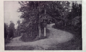
The Ryer Way-Eagle Rock Reservation.

The 28th we went to Newark, thence to Orange, thence to Eagle Rock, better known as the Essex County Park. It is a beautiful place for scenery; on the east one can look for miles. Jersey is quite a mountainous country, therefore