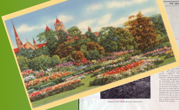
FLOWER BEDS IN BRANCH BROOK PARK, NEWARK, N. J.